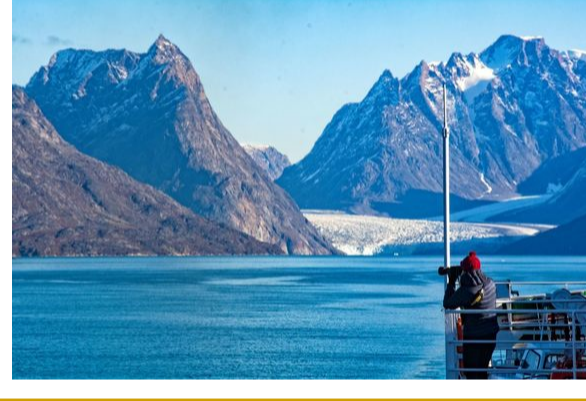
Photo Tips for Your Next Adventure Canada Experience